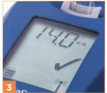
3 Results appear in just about 1 second