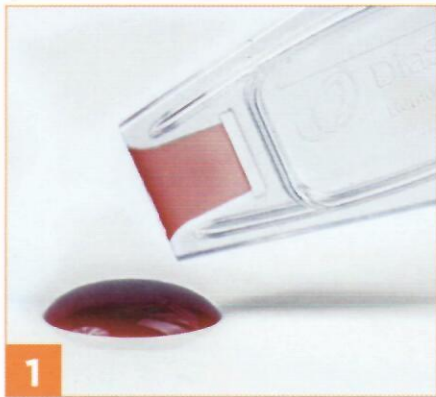
1 Collect blood sample